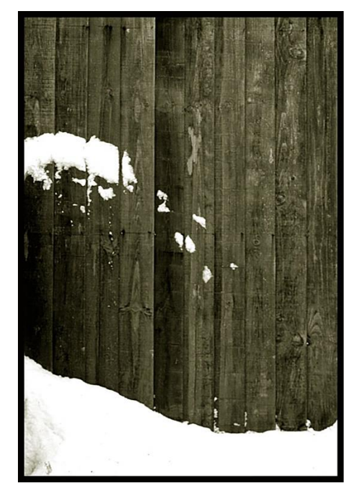
Picture 1. Jeremy Webb, "Snow Wave", 1998, Digital Photograph, 51 cm x 41 cm, PicassoMio.

Even though the viewfinder power to impact our relationships with what we see in photographs is usually taken for granted, it is the greatest tool of design in photography. While looking through the viewfinder, the creativity that it can provide via height, angle and distance to the subject is usually overlooked in favor of the subject itself and the location of shooting. However, as Sontag (2005, s. 26) quite elaborately puts it "In a world ruled by photographic images, all borders ("framing") seem arbitrary. Anything can be separated, can be made discontinuous, from anything else: all that is necessary is to frame the subject differently. Conversely, anything can be made adjacent to anything else." Therefore, the viewfinder is probably the single most important component of the design in photography because it is where people really step into the process of designing, i.e., into the array of decisions mentioned above. The example below clearly shows the power of the viewfinder in action.