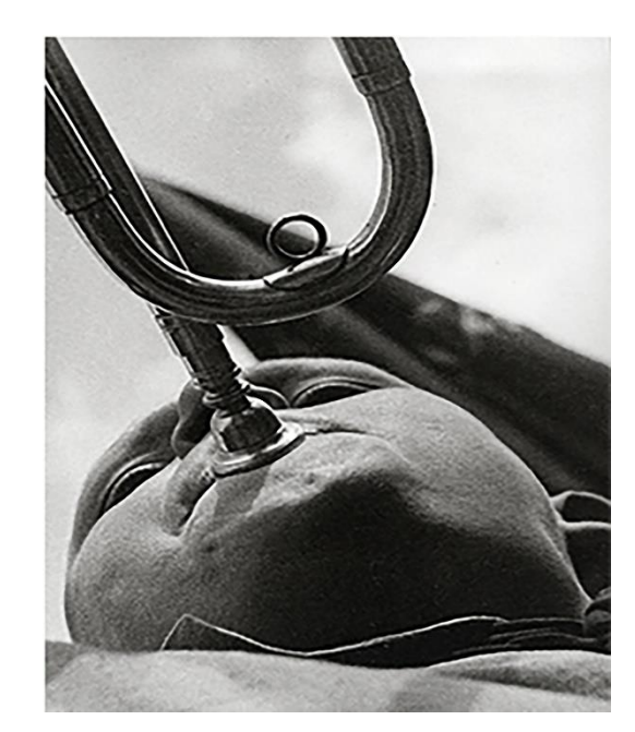
Picture 5 . Alexander Rodchenko, "Pioneer Trumpeter", Analogue Photograph, 29,2 cm x 24,5 cm, The Pushkin Museum of Fine Arts.

Hailed as a symbol of modernist understanding of art and design that swept the Western world through the 1930s, this photograph has quite a brave and striking design, which had profound impact on the practice of photography that followed later. Rodchencko's intimate closeness to the subject, which can be described as literally 'right under his nose' due to his choice of a prime lens, demonstrates the special relationship that he established in with the concept of Modernism as result of both the choice of lens and distance to the subject. Curves of both the trumpet and the head of the trumpeter perfectly match each other and the dark part above the trumpeter's head diagonally cuts the frame into two equally spaced dark and light areas, all of which are indicators of the modernist expectations of perfection and precise execution in the works of art. The expressive face and determinism on the trumpeter's face easily perceived at such closeness also complete this scene because Rodchencko adjusted the distance to his subject and the angle of taking the photograph to transmit his vision, which was to leave anything and everything that may distract from this vision to communicate the idea of Modernism in his photograph's final design.