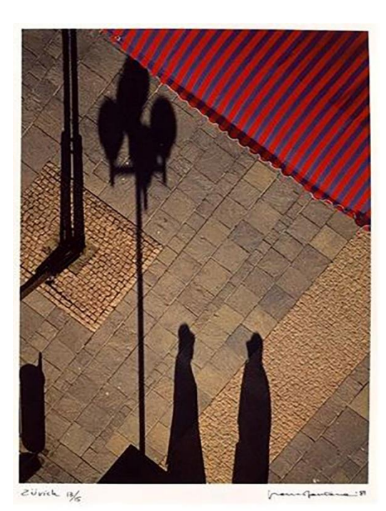
Picture 4. Franco Fontana, "Zurich", 1981, Digital Photograph, 50 cm x 33 cm, Artnet.

Rather than taking the photograph directly from across the two people whose shadows are cast on the street, the photographer radically changed his vantage point to shoot the scene from above them and this brave decision clearly made the design of the photograph more planned and the final composition more dynamic. This clearly shows that decision to use bold and unusual angles during the design process in photography should only be based on a plan to add new and well-thought layers of meaning to the subject instead of an effort to 'disguise' a problematic framing or lack of planning. Because the design in photography is basically a complex mixture of continuous search and selection, all the content seen through the viewfinder as well as the environment that surrounds photographers outside the viewfinder need to be examined to clarify the emotions and ideas about the scene before pressing the shutter. An analytical stance like this is not exclusive for photography; however, it certainly deserves consideration and application in the decisions regarding the photographic design.