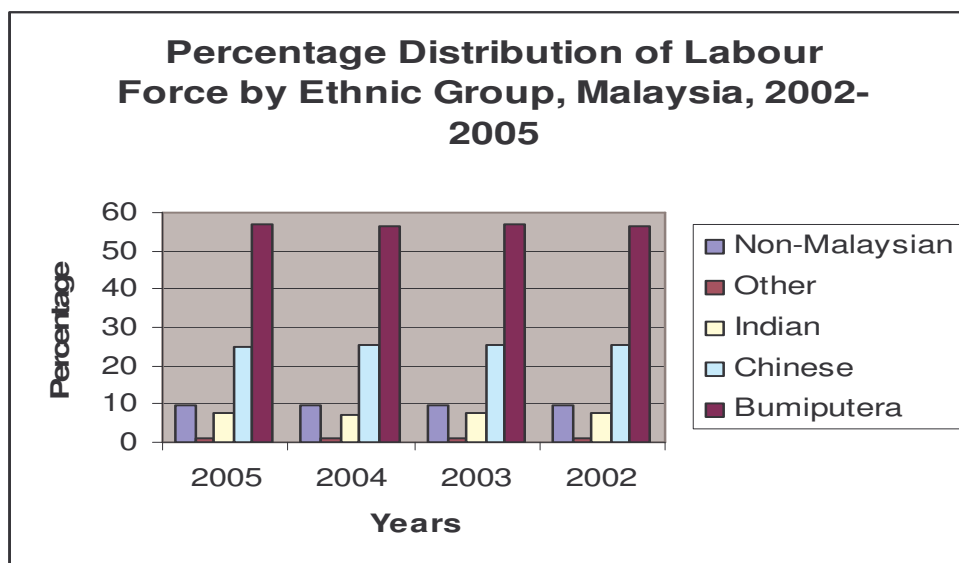
Chart 1: Percentage Distribution of Labour by Ethnic Group, 2002-2005

Source: Labour Force Survey Report, Department of Statistics, various years.