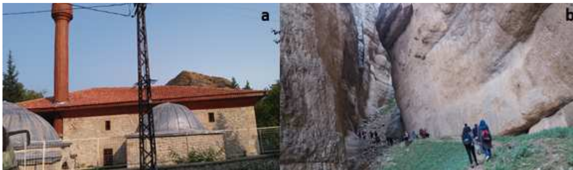
Photograph 2: Iskender Pasa Mosque and Tombs (a) and The Cehennem Deresi Canyon stands out with steep walls (b).