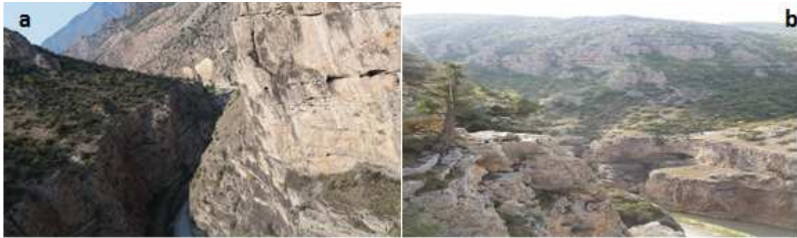
Photograph 1: The Cehennem Deresi Canyon in Ardanuc (a) and morphological units suddenly elevating from the river level in the Cehennem River Canyon (b).