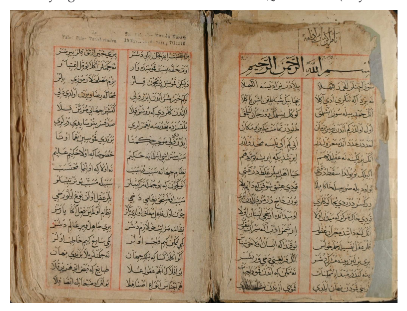
The copy of Ankara

nama . Similarly, the 43rd of Qabus-nama is lacking in Muradname . In fact, Bedr-i Dilşâd does not have an expression saying that the work is a translation of Qabus-nama (Ceyhan 1997: 44-50).