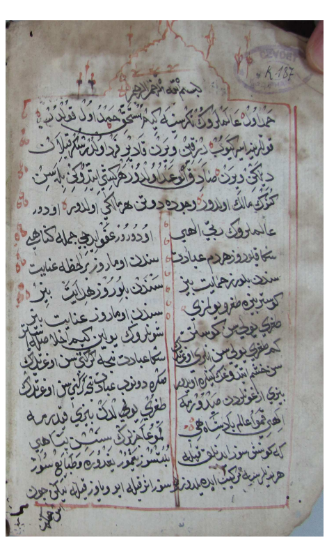
The copy of Istanbul