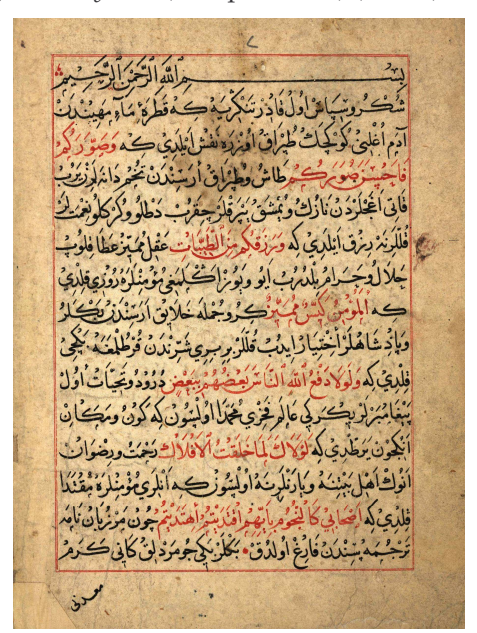
The copy of Cairo

To this application we can give the following examples: "alnuŋı ~ alnıŋı ("your forehead") (56/9), aru ~ arı ("pure") (8/9), çalucı ~ çalıcı ("player") (153/10), degşürler ~ degşirler ("they change") (117/4), dokınmaya ~ dokunmaya ("he/she do not touch") (156/13), unıtma ~ unutma ("you do not forget") (154/10), uyır ~ uyur ("he/she sleeps") (54/14), yavuzlık ~ yavuzluk ("malice, evilness") (90/8), yazucı ~ yazıcı ("scriptwriter") (166/5)."