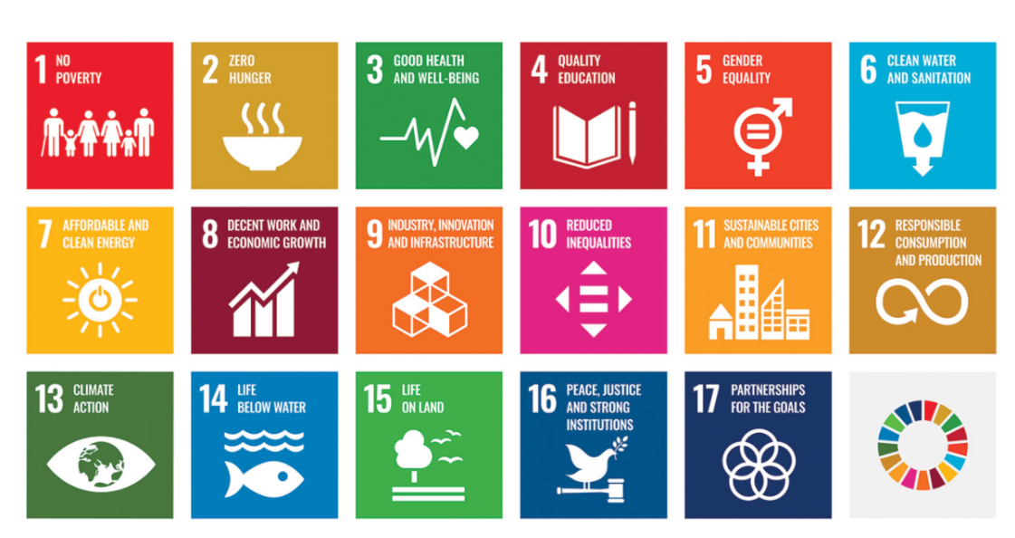
Figure 2: United Nations Sustainable Development Goals (SDGs)