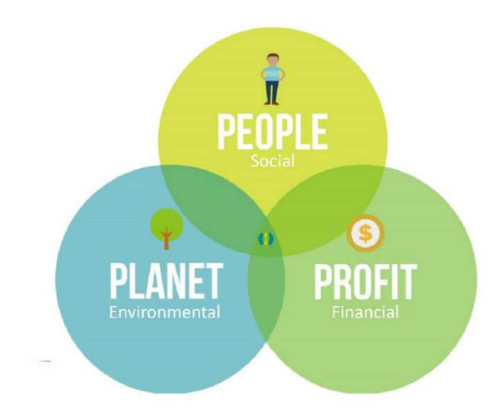
Figure 1: Triple Bottom Line

As part of the 2030 Agenda for Sustainable Development<sup>4</sup>, United Nations has endorsed sustainable development paradigm on a global stage, renaming its millennium goals as sustainable development goals (SDGs) in 2015 as shown in figure 2, providing a global platform across nations to solve global challenges ranging from ending poverty and hunger to providing quality education, reducing inequalities, strengthening institutions and international partnerships to reach our common global goals.