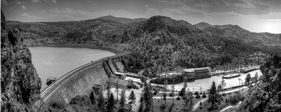
Figure 1. Çubuk Dam 1936 Ankara

During the last two centuries, Turkish intelligentsia has believed technology is prerequisite of development and welfare. Hence, from the very beginning of the modernization process, importation of technology and know-how has been assumed as vital and supported by the nation state. Unsurprisingly, this attitude was not only specific to the Turkish case. In 20th century, many other late-industrialized or unindustrialized nations at the threshold of modernization like Turkey believed in the critical relationship between prosperity, modernity, and technology. Hence, they suggested a strong link between technology, and the construction of national identities; but this is paradoxical when we consider the internationalization of technology especially after industrial revolution.