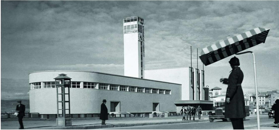
Figure 2. Florya Sea Pavilion 1934 Florya- Istanbul by Architect Seyfi Arkan

Under these circumstances, technology and its edifices such as factories, bridges, buildings etc. became both representations of the national identities and measures of the degree of development of the nations. By the establishment of the Turkish Republic in 1923, this double role was epitomized by construction of modern buildings such as Çubuk Dam, Florya Sea Pavilion, Ankara Opera Building (Old Exhibition House 1 ) etc. These buildings were meant to be objects of national pride as well as the modernity of technical knowledge in civil engineering expertise and architecture. From this point of view, the Turkish case has no significant difference from the others like Greece, Portugal, Mexico or Italy 2 in the main narration of nation building and patriotic profile of the constructive professions. In spite of the same basic characteristics of the age, the story differentiates due to inner dynamics and reactions of a non-western society, which had been vassal of an empire in difficulties.